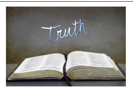
The Holy Bible (Original King James Version)

Sunday School Review: We Speak The Wisdom Of God In A Mystery: Scriptures: I Corinthians 2:7, 10-11